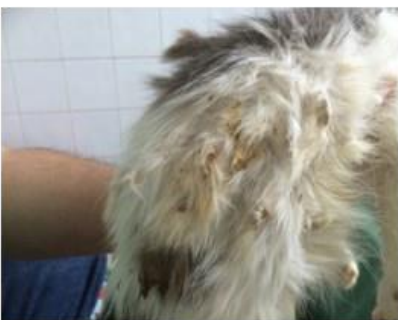
Emaciated, covered in faeces and sick

neutering and emergency treatments, plus cat food and other medical supplies. We already have more cats than we can find homes for. In January we had a call about 60 un-neutered, starving cats in a cramped flat. With the owners not having money for cat food, cat litter or even basic medical supplies, the situation sounded dire. This was confirmed as soon as we went to investigate. Many of the cats had injuries, some very severe. It took several visits to rescue all the cats, some even needing trapping because they were not used to being handled and were flying off the walls. We started by removing the most sick and emaciated cats. Thanks to the help of local vet Bichos, every cat received the medical attention it needed. Some of the cats we blood tested because of the awful condition they were in, but all were negative, which just proved the only thing these poor cats were lacking was fresh air, nutrition and a clean environment. There was not a single cat litter box in the flat. These cats will need time to regain strength and adapt to new environments.