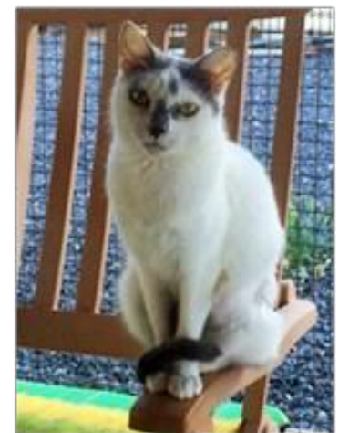
Sally, one of the cats we removed from the flat. Now she needs a good home.

Some of the cats we blood tested because of the awful condition they were in, but all were negative, which just proved the only thing these poor cats were lacking was fresh air, nutrition and a clean environment. There was not a single cat litter box in the flat. These cats will need time to regain strength and adapt to new environments.