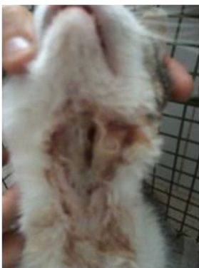
Rotten abscess from fighting

RESCUE OF OVER 60 CATS We are a volunteer neutering charity - not a sanctuary. All our funding comes from our members and public donations. Every penny is used on vet bills for